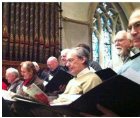
The male chorus, both sacred and profane!