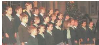
Powell Corderoy Primary School (upper) St Joseph's Catholic Primary School (lower)