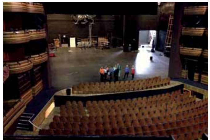
Did the Tardis take the audience? Was it our Welsh dalekt?