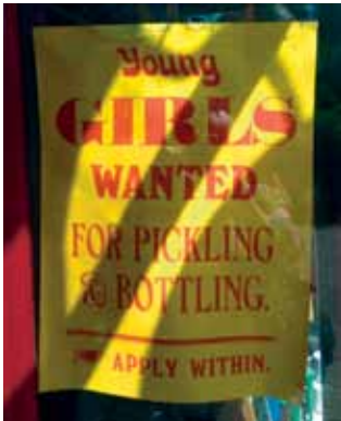
Spotted at St Fagans Welsh Folk Museum – too late for the altos