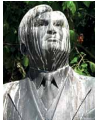
Nye undeservedly covered in poo