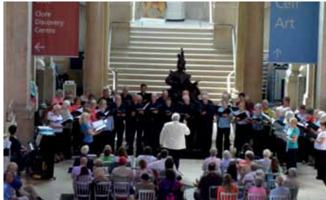
BCS singing at the National Museum of Wales