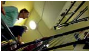
BCS reaches new heights – RWCMD 76 stairs to dressing room