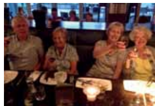
...toil and trouble