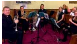
RWCMD Symphonic Brass Quintet provided harmonious interludes