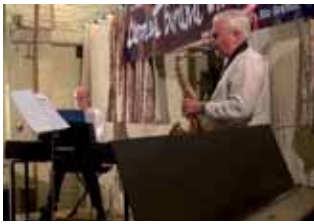
Greensand Trio minus one